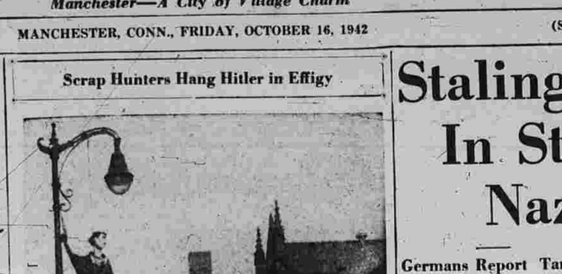
An effigy of Adolf Hitler hangs from a lamp post above a pile of scrap collected in Manhattan's Yorkville section...